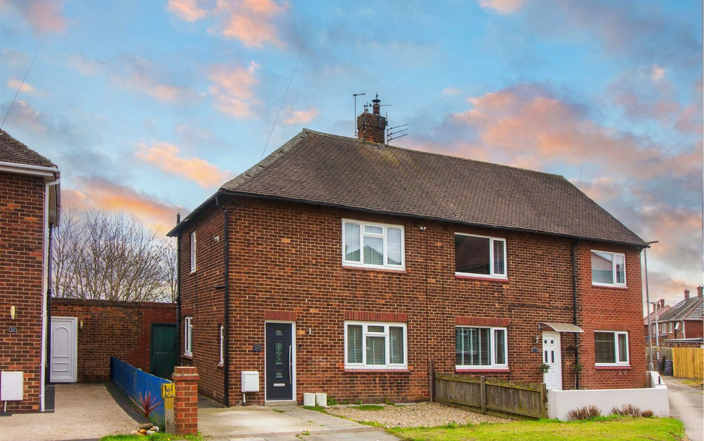
Trinity Grove, Cramlington NE23 7EX